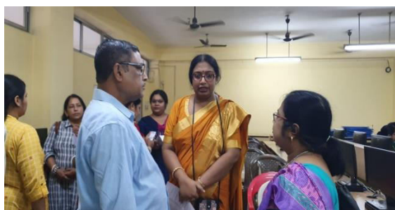
Conversation with the guardian of the mentees during PTM